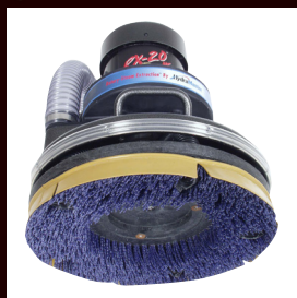
RX Hard Floor Attachment