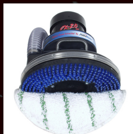
RX Pad or Bonnet Driver Attachment